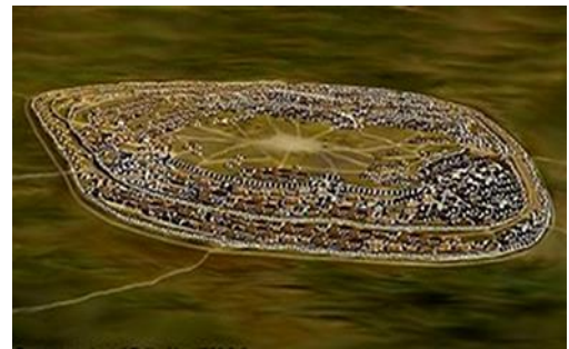
Taljanky circa 4000 BCE

Our ancestors were not "primitive". They were more intelligent and wiser than we have thought. For instance, the authors show that while still foragers , large groups came together seasonally to cooperate and build a monumental stone center in Turkey called Gobekli Tepe, not quite as large as the Stonehenge but 6000 years before. This monumental center took thousands of hours of coordinated labor and planning to build. Such places were thought to be possible only after agriculture was adopted when social groups were larger, there was a surplus of food and labor to allow such extravagant building, and there were strong political leaders with coercive power to direct the building. There have also been found a few very rich burials of foragers, such as Sungir (32,050 to 28,550 BCE), again, long before we expect them, and before there were aristocratic families who paid for such burials.