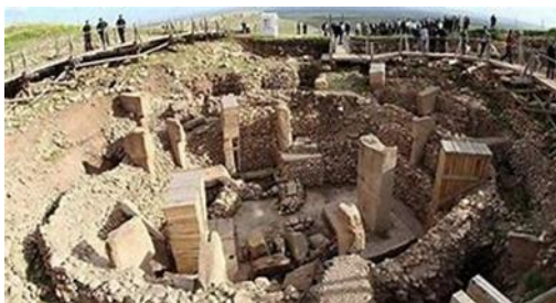
Gobekli Tepe 9500-8000

Anthropologists before the 1960's described groups of foragers that formed into small hunting parties with a strong leader who had real coercive power over the members during a hunt. Later in the year, the same tribe gathered into much larger groups without obvious authority figures. There may have been ceremonial "ranks and honors" but no coercive political power as we understand it. In effect, our ancestors had more ability to change their social systems and more imagination about ways to do that. Whereas we are "stuck" with nation