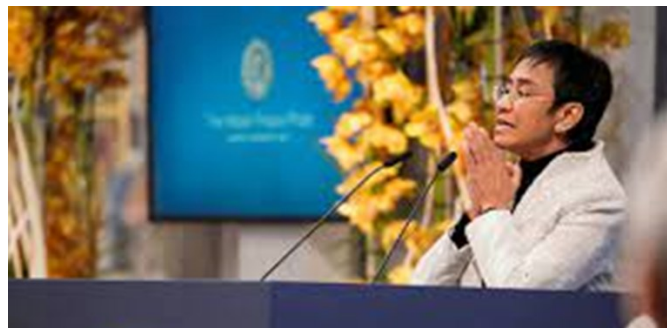
Maria Ressa giving her speech accepting the Nobel peace prize in 2021

So, America, you have been warned. Ressa is very worried about what could happen here in 2024. We need the rule of law in the virtual world. We need to find a way to make the original promise of the World Wide Web come true. Campaigns of lying for political advantage is not “free speech”. If we revere our democracy, if we hold it sacred, then we should treat our public spaces, the forums where we express ourselves, just like we treat the spaces inside a courtroom where telling a lie is perjury. For a democracy to work, we must find good sources who want to report the truth. “You can’t have integrity of elections without integrity of facts.”