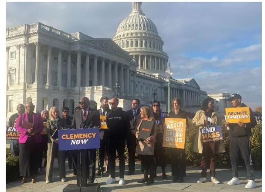
House Democrats call for President Joe Biden to commute sentences of federal death row inmates during a Wednesday news conference outside the U.S. Capitol.